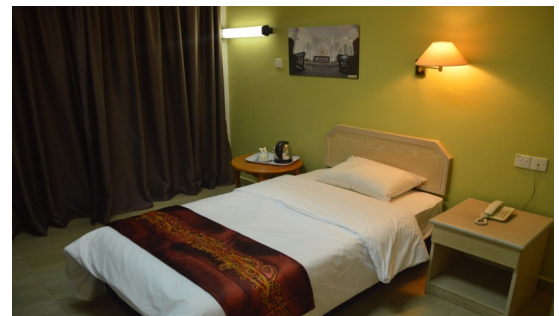
Single Room: RM70.00 per night