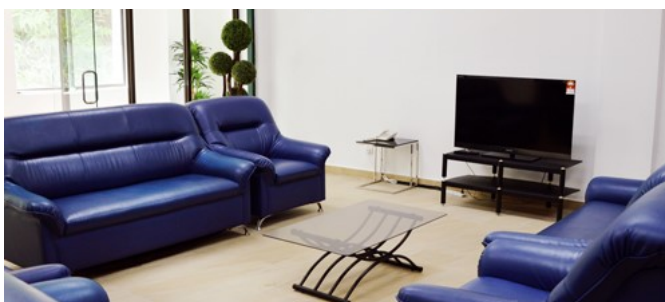
Spacious recreation room with television