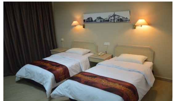
Twin-Sharing Room: RM100.00 per night